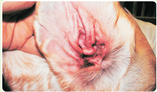
Otitis erythematosa-ceruminosa