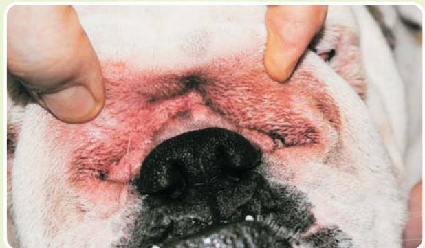
Intertrigo in an English bulldog showing facial folds