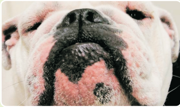
Erythema of the lips and muzzle